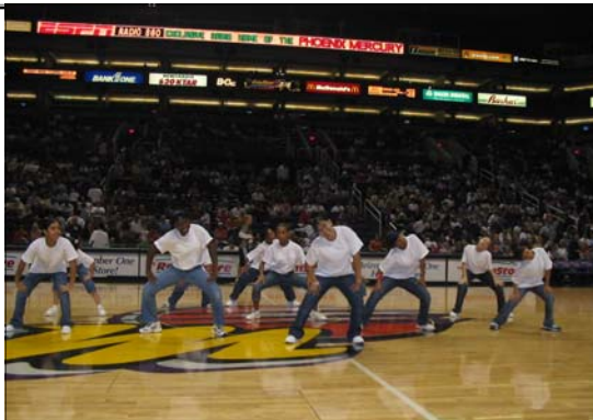
The Stardust Hip Hop Squad gets the public all jazzed up as they perform a routine at half-time during the Phoenix Mercury on Saturday July 24th at the America West Arena.