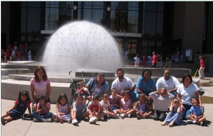
A group of Stardust Head Start students and parent take a short break to view and enjoy the spiral foundation in front of the Phoenix Symphony after the mid-morning concert. For many students this was their first visit to the symphony hall.