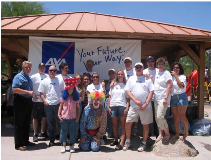
AXA Advisors LLC selected The Stardust House as the local community organization to partner with on a community service project. Over 20 company employees volunteered to coordinate and plan the festival. A big thanks to AXA Advisors! LLC for a wonderful and fun event!

on a personal level, hearing them talk about their hopes and dreams and helping them take small steps. Something unique I see at South Ranch is the youth are community oriented, they're supportive of one another, most know each other and play together, I find this to be different from other neighborhoods."